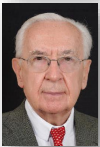
Jacques de Larosière Former Managing Director of the IMF