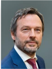
Pierre Wunsch Governor of the National Bank of Belgium