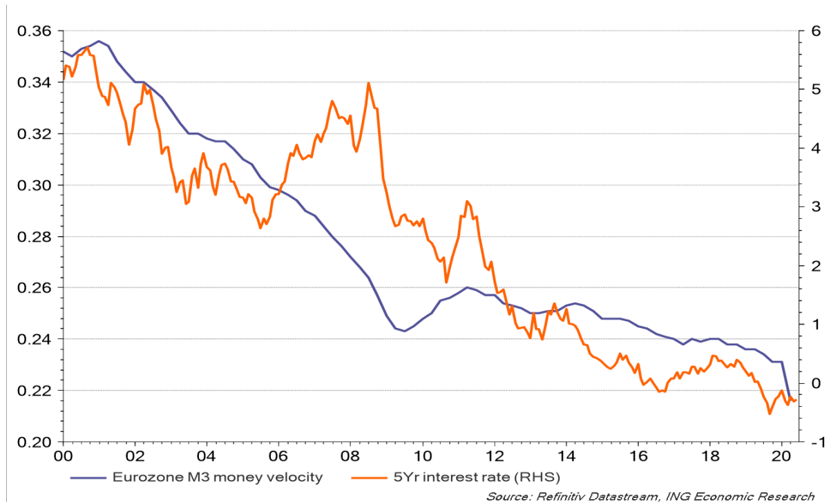
Graph 2: Declining velocity